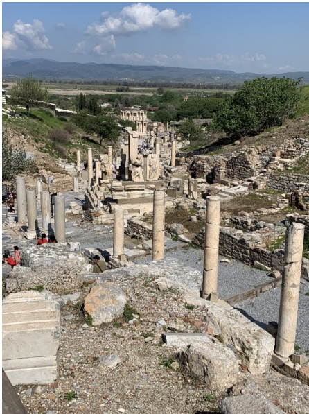
Curetes street in Ephesus looking toward the famous Celsus Library.

Ephesus was indeed a Roman city in Paul's time as it was the permanent headquarters of the Roman provincial administration and capital city with ongoing Roman construction projects, even bigger than the construction projects here in Beatrice. I found Paul as I walked one of the main streets in Ephesus called "Curetes Street". He would have seen monuments, fountains, shops, and beneath the street a well-developed sewer system which supported the Roman baths and latrines. He would have passed beside terrace houses where the wealthy lived, which are similar to today's condominiums. These apartments are well preserved, with continued excavation to uncover their beauty, such as the mosaics. Many more people lived in cramped and crowded apartments.