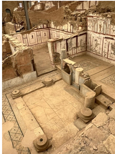
Pastor Sonja Maclary took this photo showing the rooms and mosaics much better than my photos!